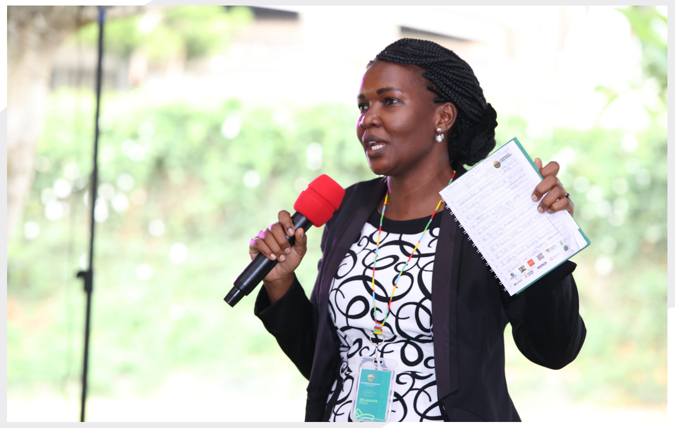
Evelyn from FAO Kenya addressing delegates at the 2022 EAIP Land Summit in Nanyuki

Mainstreaming of gender and youth in conservation efforts was encouraged to improve their livelihood as well as ensure women, male and female youth are not left behind. Securing women's land rights will give them equal power with the men to negotiate for compensation and benefits associated with conversation and other mega projects. Direct and targeted support to women and the youth to understand their legal rights to land and natural resources, inclusion in land inventories, build voice and agency to engage government, the private sector and other stakeholders was emphasized. There was consensus that IPs need to do more to engage policies to establish better legislations and mechanisms for promote conservation that is anchored on indigenous knowledge and respect local structures responsible for governing land and natural resources. Investors guidelines should also be provided to support communities engage and ensure social and environmental safeguards are examined and implemented.