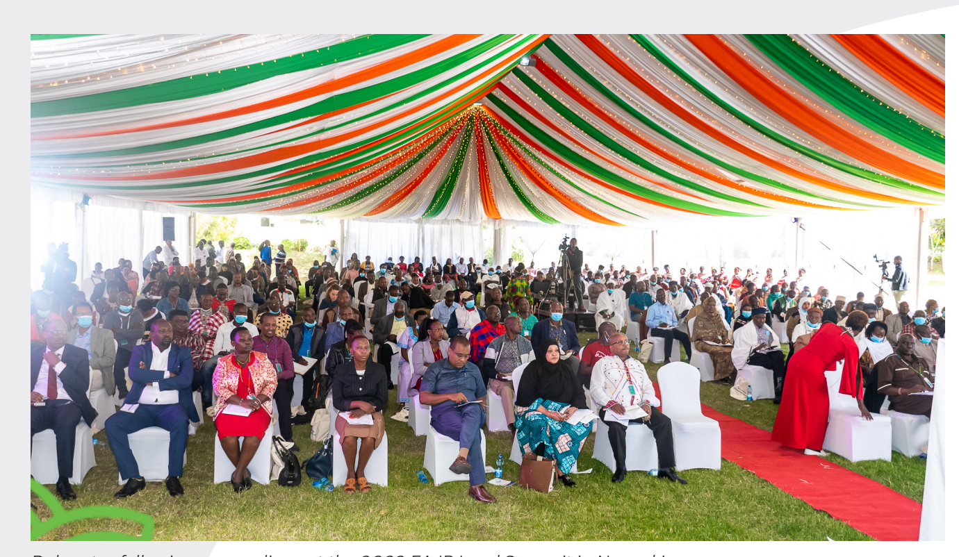
Delegates following proceedings at the 2022 EA IP Land Summit in Nanyuki

To promote dialogue on specific IPs issues, experience sharing and learning, the summit held several plenary and parallel sessions that brought together speakers drawn from different IP communities across East African countries. These sessions featured representatives of IPs, as well as representatives from county governments, the MLPPUD, NLC, EALA, CSOs and other development partners who shared their experiences, challenges, and opportunities in addressing land and natural resource